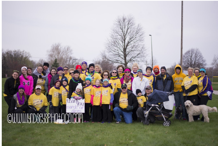
Team 4 Miracles 2014