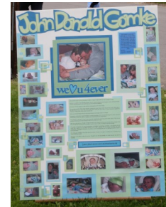
Avenue of Angels