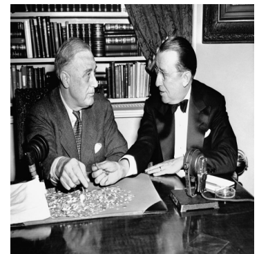
Counting Dimes: Basil O'Connor (President, National Foundation for Infantile Paralysis) and President FDR, counting dimes at the White House. C 1938