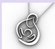
M.C. Ginsberg March of Dimes Pendant

One of a kind, EXCLUSIVE, Sterling silver, hand pierced pendant, matte and high polish finish with 16" sterling silver cable chain.